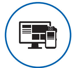
Public Safety Command Center