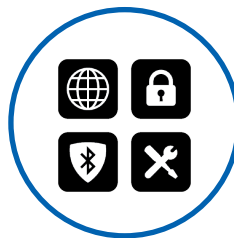
Managed & Support Services