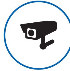
Video Surveillance & Analytics